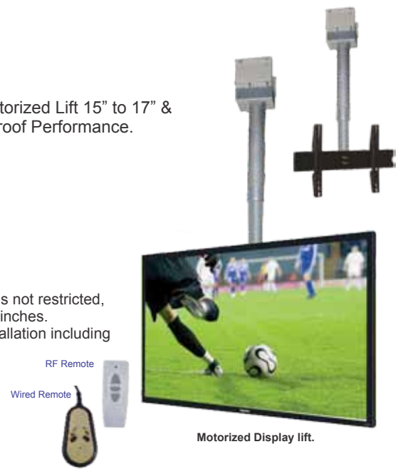
Motorized Display lift.