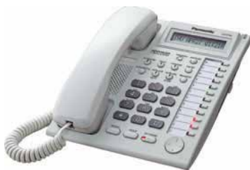
■ KX-T7730 LCD, Speakerphone Unit