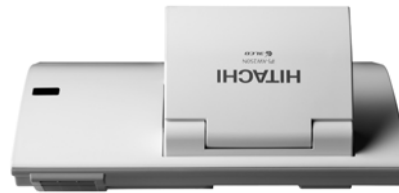
Front 3/4 View

the specific interactive needs of both corporate and education users, the CP-AW2519N is easy to install, easy to use, and easy on the environment. Plus, Perfect Fit 2 enables the user to adjust individual corners and sides independent of one another as well as correcting geometric and complicated distortions, allowing the projected image to fit correctly to the screen quickly and easily.