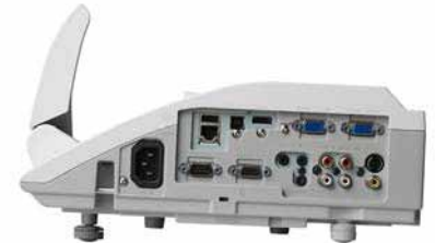
Left Side Profile