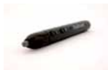
Electronic pen (optional)